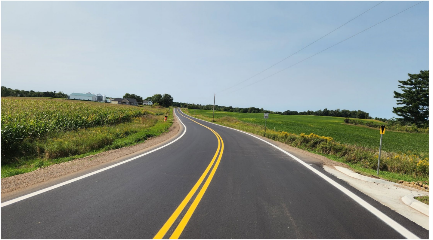
Reconditioned CR 60