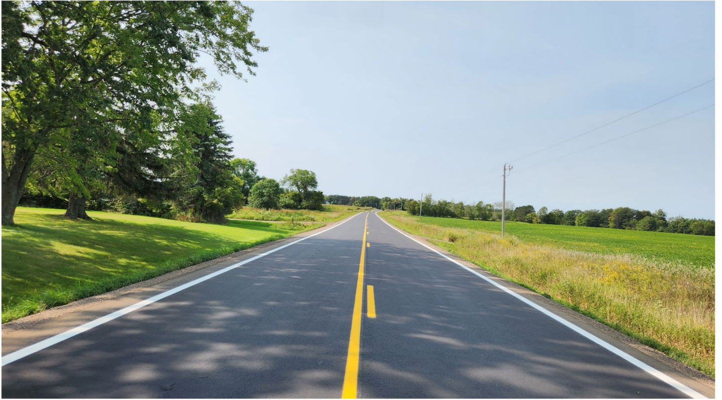
Reconditioned CR 60