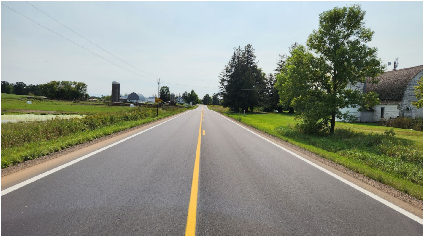
Reconditioned CR 60