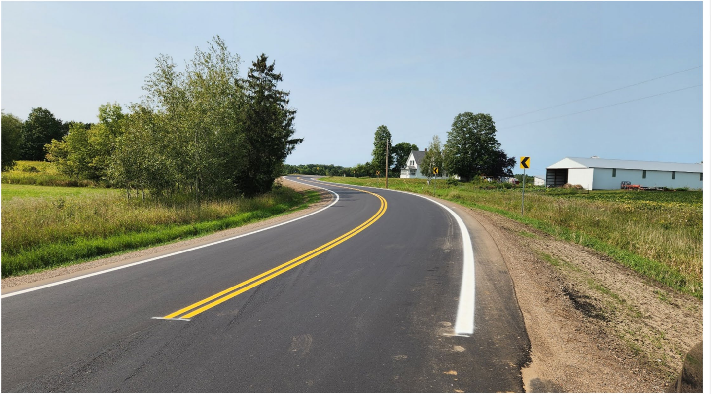
Reconditioned CR 60