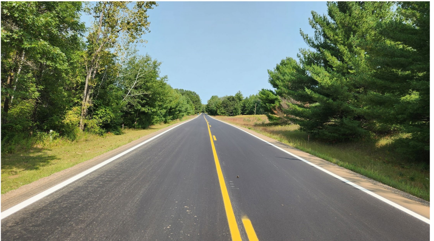
Reconditioned CR 60